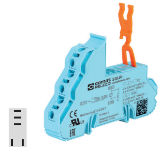
fig. 1. Wiring diagram