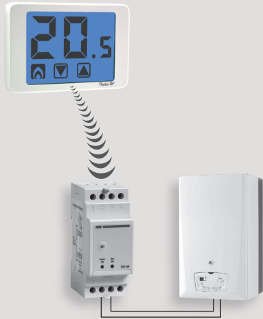
Example of connection with 1 channel remote actuator