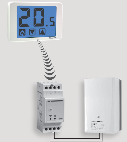
Example of connection with 1 channel remote actuator